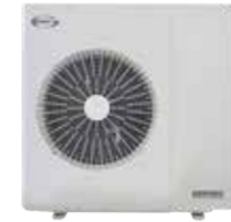
10kW AERONA 3 HPID10R32BODY