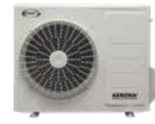
6kW AERONA 3 HPID6R32BODY