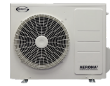
6kW AERONA 3 HPID6R32BODY