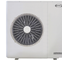
10kW AERONA 3 HPID10R32BODY